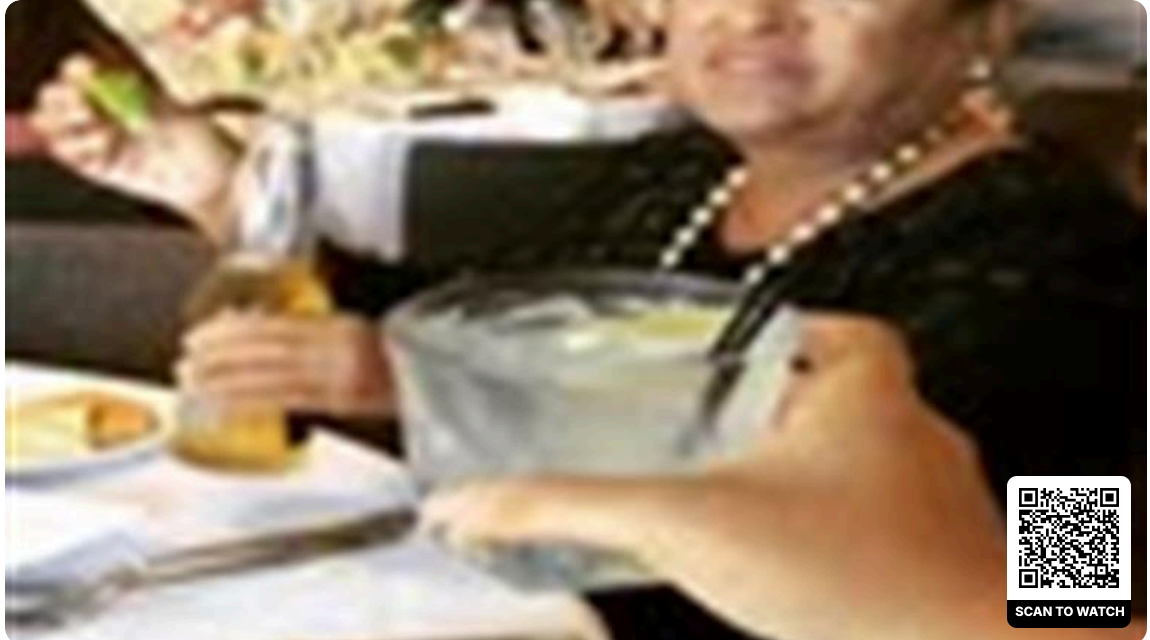
Salud a mi hermosa tía ??